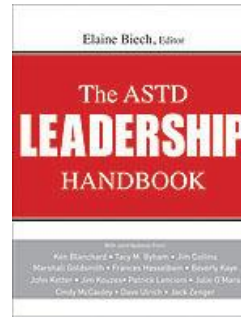
ASTD Leadership Handbook