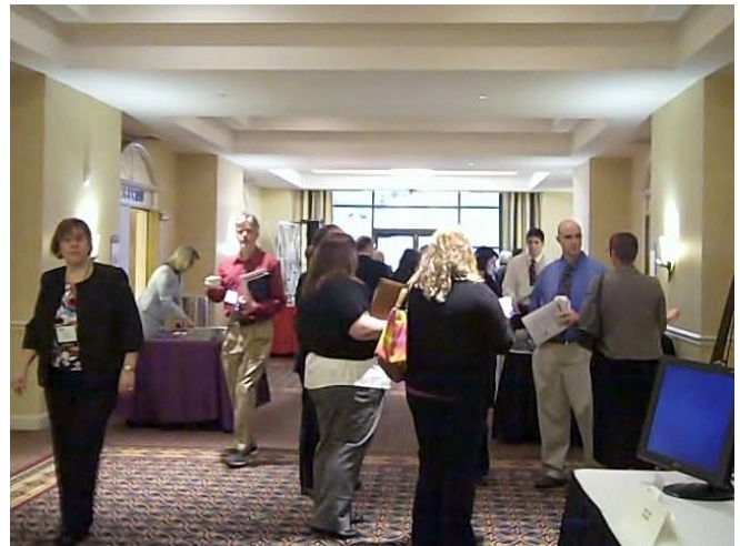
Conference attendees network between sessions

Save the Date: Hudson-Mohawk ASTD 17th Annual Workplace Learning & Performance Conference Friday, April 27, 2012 at the Albany Marriot