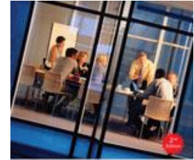
Consulting on the Inside